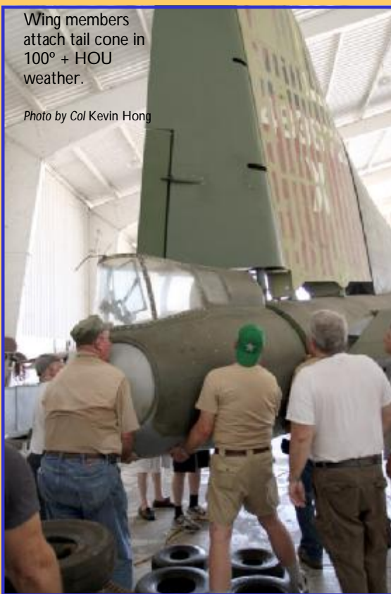
Wing members attach tail cone in 100° + HOU weather.