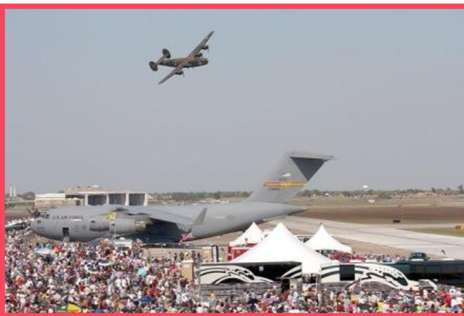
"OI 927", the CAF's B-24 graces the skies with a beautiful photo pass over Ellington Field.