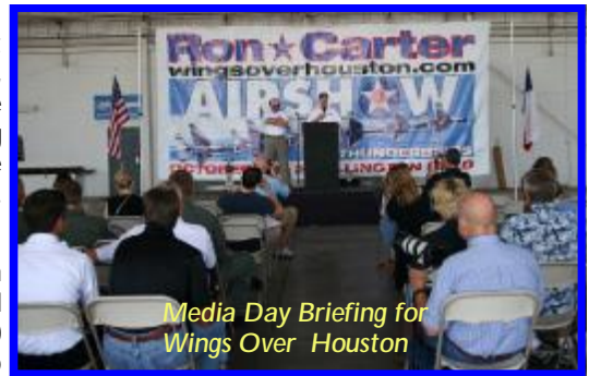
Media Day Briefing for Wings Over Houston

Yes, it was a month of surprises, but we still have a wealth of volunteers, wing members, supporters and a strong resolve to fight through these challenges.