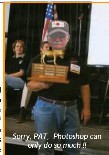
Sorry, PAT, Photoshop can only do so much !!