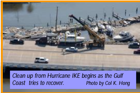
Clean up from Hurricane IKE begins as the Gulf Coast tries to recover.