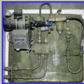
Hydraulic Panel BEFORE