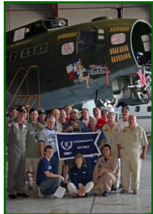
Gulf Coast Wing members gather in front of TEXAS RAIDERS, after presentation of the award March 15, 2008

The Gulf Coast Wing is hereby presented the Commemorative Air Force Distinguished Unit Maintenance Award for 2007 in recognition of their outstanding dedication and en-