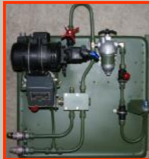
Hydraulic Panel AFTER